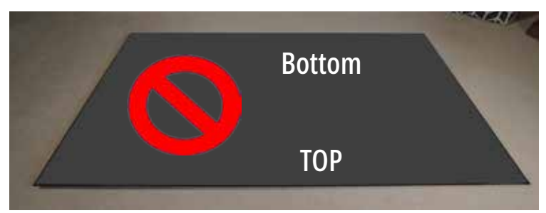
INCORRECT DIRECTION: If the material is black as shown below then it is upside down and is instead positioned to show the ABOSRBENT LAYER.